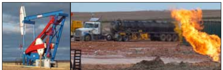
Gas is being flared on many wells

Of course with this boom, especially in a town with a population listed in the latest Rand McNally Road Atlas as 12,193, there are problems. One of them obviously is housing, land to build on and the lack of hotels and apartments. Construction is everywhere including