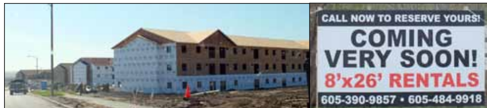
Construction all around Williston They've already come and sold out; hundreds of trailers at $1500 a month rental! Watford City, N.D.

then be off down the road. But expediency was not on the menu that morning.