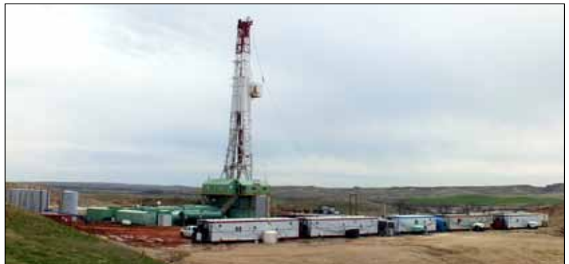
Typical drill site just over the border from Montana in N.D., East of the Yellowstone River

It is well known that if a man or woman who works in the oil industry and begins to truly follow Jesus Christ, there is a good chance that they may travel to places around the world sharing the Gospel where missionaries and others are not accepted.