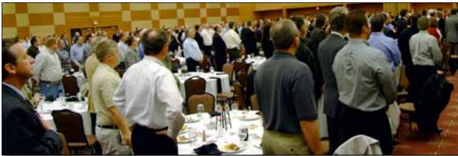
Attendees standing for the pledge of allegiance

We had seating for almost 700 and there were very few empty seats, so attendance estimated to be around 650 people for this first-time event that was organized and pulled off in less than four months from initial conception. Those of us who organized the event declared it as a definite God-blessing for those in attendance and those who witnessed the masses flocking downtown a little after six this morning to demonstrate that “we are not alone” in our faith.