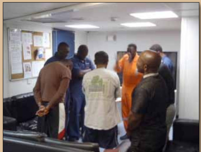
Trident 8 Prayer meeting with men from 4 different countries