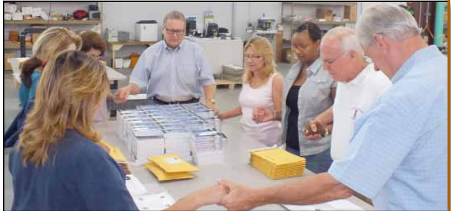
Praying over the Bibles before mailing